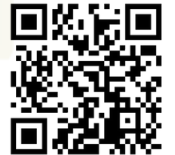
Athletic Eligibility Documents

Athletic Physical must signed off by an MD or DO, be dated and have the doctors license number. Once physical is completed have ready to submit a photo (All four corners of page, including dates must be visible) of the physical into Home Campus.