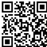
Athletic Clearance Slides

Link to athletic eligibility documents on our school website. Can access link to homecampus.com