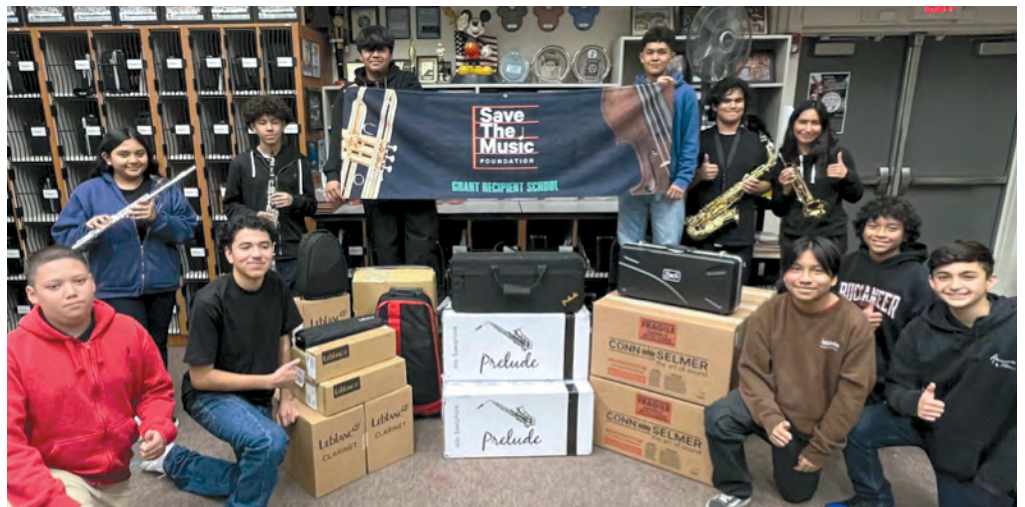
Sycamore JHS band students unboxing new instruments courtesy of a grant from the Save The Music Foundation.

Dance. A multi-year grant from Save The Music Foundation ensures more instruments and the establishment of digital music production labs. Arts education in AUHSD fosters personal expression and communication skills, connecting students to themselves and each other, guiding them toward discovering their "Unlimited You."