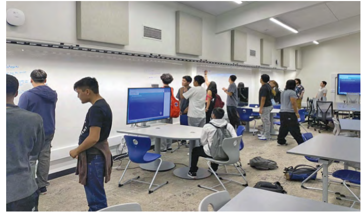
The iLab is a beautiful space for project based learning