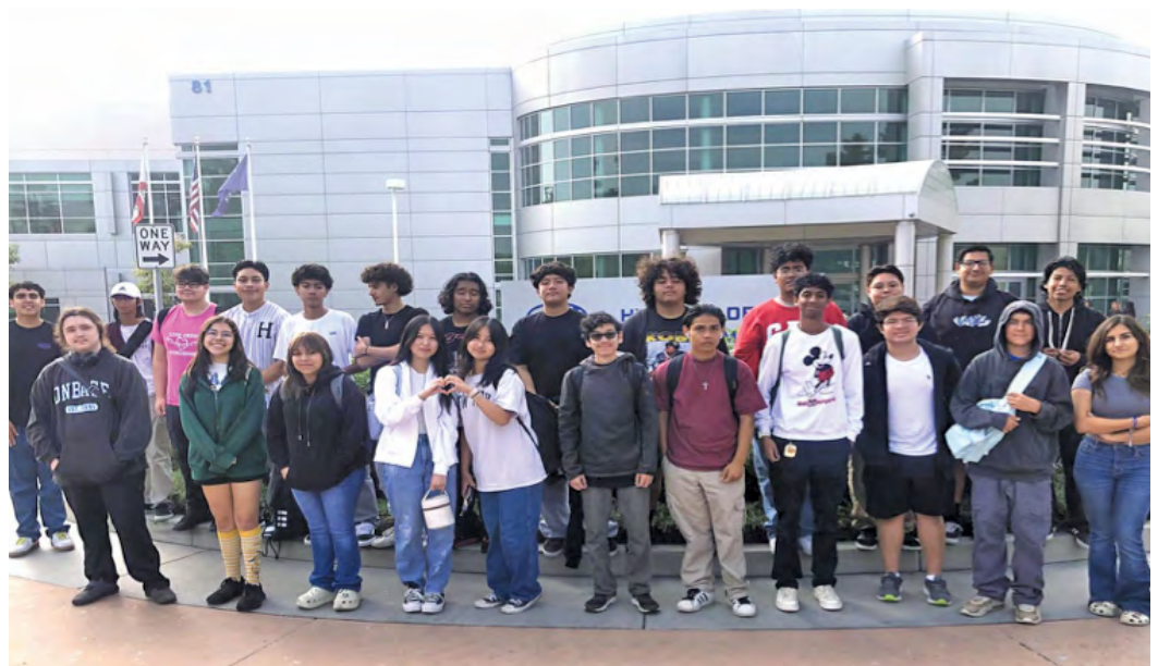
Students attending and AIME fieldtrip at Hyundai